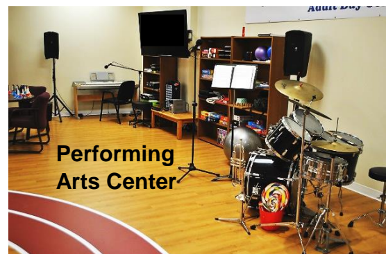
Performing Arts Center

our Members can do during the day. Since it is a large room, there will be multiple activities in progress at the same time. We measure Member's walking distance on our two-lane in-door walking track.