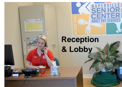
Reception & Lobby

When you arrive at Naperville Senior Center, you are warmly greeted by our receptionist, or one of our other staff members.