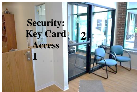
Security: Key Card Access 1

Each Member or guest is escorted through a double secure gateway to our dining area. This security is important to keep all our Members safe while they are visiting us.