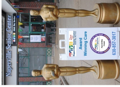
Award Winning Care

Naperville Senior Center Adult Day Services | 1504 N Naper Blvd. Suite 120 | Naperville, IL 60563 NapervilleSeniorCenter.com | info@napervilleseniorcenter.com | 630.857.3017