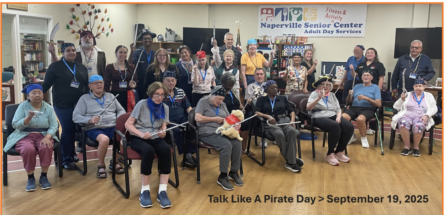
Talk Like A Pirate Day > September 19, 2025