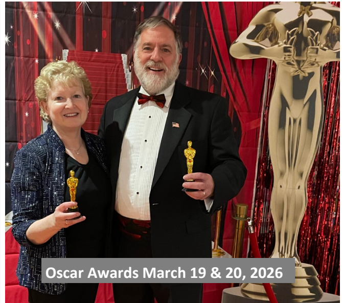
Oscar Awards March 19 & 20, 2026

Full-Day or Half-Day Programs available to fit your family's busy schedule.